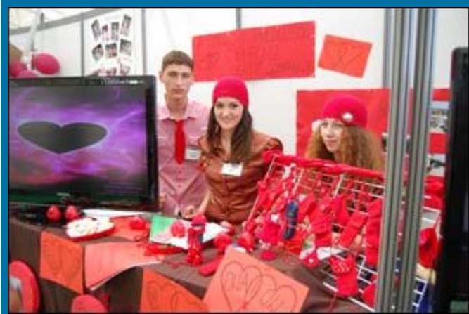
They will be travelling to Rotterdam – "Cupid", Vlasotince

BELGRADE, Serbia – Business of Love Takes Top Prize at Junior Achievement (JA) Serbia Finals.