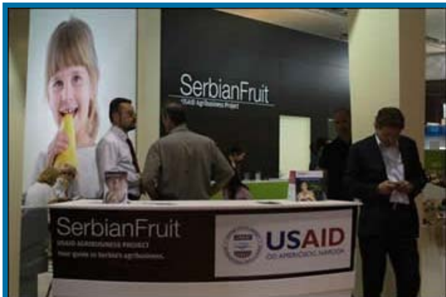
“SerbianFruit” booth at the 76th International Agricultural Fair in Novi Sad

On May 12th, a Seminar dealing with the Global Economic Crisis and Its Effects on Agribusiness took place in the Master Conference Hall of the Novi Sad Fair grounds. This event drew a large number of Serbian companies, representatives of various institutions, the academia and the media. This Seminar provided an analysis of the current international market situation, and offered potential solutions to current export constraints faced by Serbian food produce exporters.